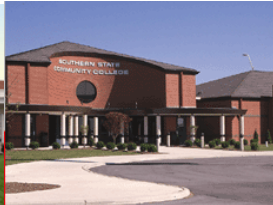
North Campus 1850 Davids Dr. Wilmington, OH 45177 (937) 382-6645 x4680