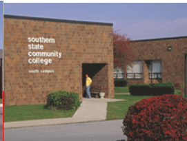
South Campus 12681 US 62 Sardinia, OH 45171 (937) 695-0307 x3680