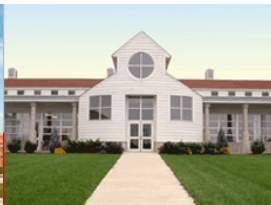
Fayette Campus 1270 US 62 SW Washington CH, OH 43160 (740) 333-5115 x5680