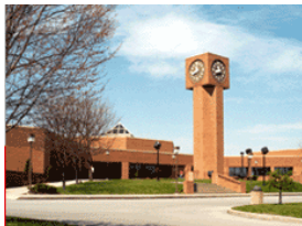
Central Campus 100 Hobart Dr. Hillsboro, OH 45133 (937) 393-3431 x2680